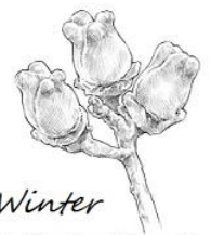
Winter Witch Hazel