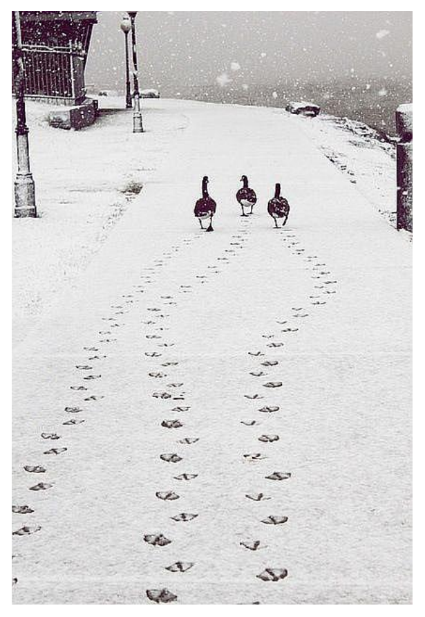
"The only thing I like better than a brisk walk on a crisp winter day is to settle in afterwards and read my Medvil Messenger!"