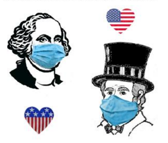
... Monday, 15 February