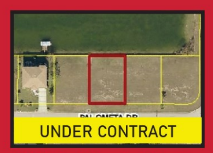
$32,500 - Palometa Dr Lot 3