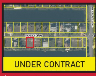
$38,900 - Gardenia Dr Lot 8