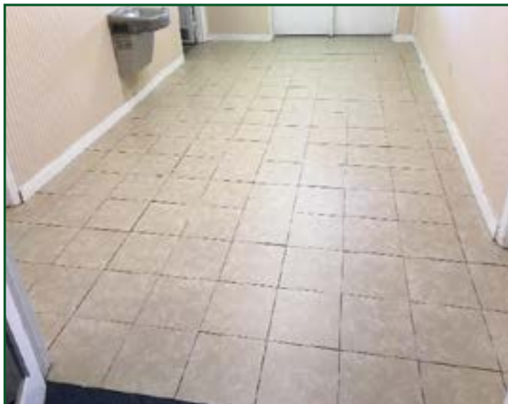
New tile floors

This project would take several days to complete so they decided to be here early and get an early start. Both areas had previously had carpet on the floors and had become stained and soiled from dirt, paint, food, drink, and who knows what else. Cleaning and sanitizing these areas would be much easier with tile on the floors.