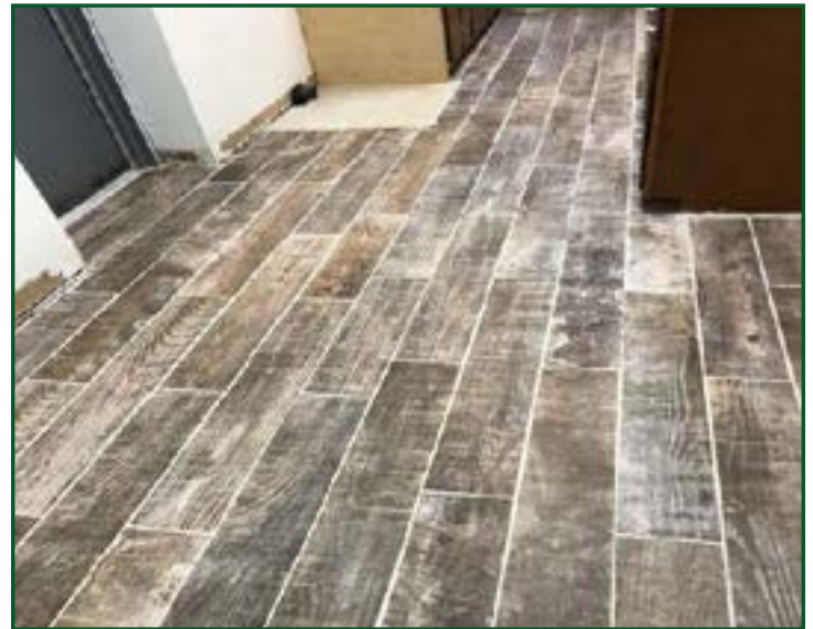
New tile floors