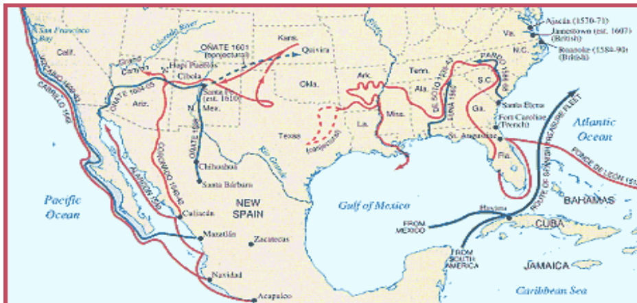
Spanish Exploration of North America

In turn America becomes a sought-after chip in the game played by the monarchs of Spain, France and England for control over Europe and for global hegemony.