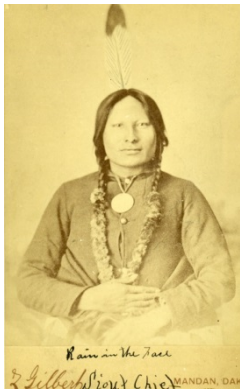
Lakota Chief Rain-In-The-Face

Starting around 16,000 BC, or earlier, America's first settlers wend their way across a 1000 mile "land bridge," formed by a sea level drop in the Bering Straits, which once linked the eastern edges of Siberia to western-most Alaska.