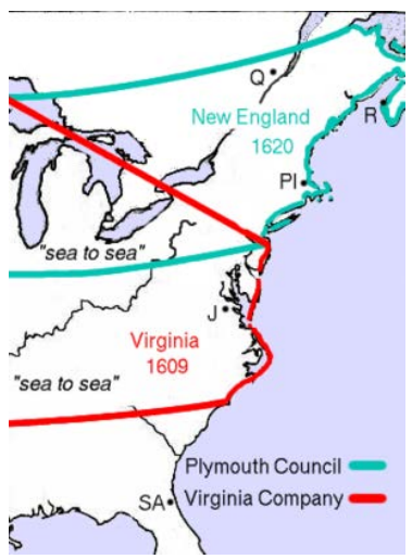
Two British Corporations Found Colonies Along the Atlantic Coast

The principal corporation during Elizabeth's reign, The London Company, is granted Atlantic coast territory extending from the 34<sup>th</sup> (Cape Fear, North Carolina) to the 41<sup>st</sup> parallel (Long Island Sound). This results in England's first American settlement, the Roanoke Colony, set up by Sir Walter Raleigh in 1584 on lands he calls Virginia, in honor of the Virgin Queen. But when long-delayed supply ships from England revisit the colony in 1590, all signs of the 110 settlers have vanished without a trace.