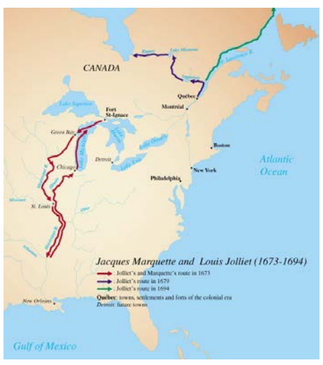
French Exploration of the Mississippi River

After a hiatus lasting six decades, Samuel Champlain retraces Cartier's route and successfully opens a French outpost at Quebec in 1608.