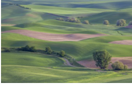
photograph-Palouse in the Spring

Born in Czechoslovakia in 1960 and immigrated to the US in 1970. I was always interested in drawing and painting even at an early age. My parents gave me my first pastels and oil paints many years ago. While going to school I got a job working in a department store that sold camera equipment and quickly got into photography. Over the years I set aside my pastels and oil paints and also my camera equipment. Different interests caught my eye in later years. In 2009 I caught the photography bug again and haven't put my cameras down. During the last 15 years I have joined numerous photography clubs and have entered local and international shows. Over the years I have been published and won numerous awards. My photography can be found in private collections in North and South America, Europe and Africa. I am still in awe that you can take photos in the morning, while you're having coffee download your images, process and print, and also frame and hang your new photos all before lunchtime. It is amazing how technology has improved over the years and I hope my work has also improved enough to be recognized worldwide. Now instead of painting with pastels, oil paints and watercolors, now I paint with my camera.