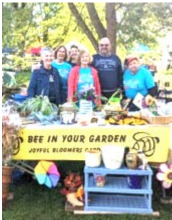
Joyful Bloomers GC at Greenock 1790 Log House Days