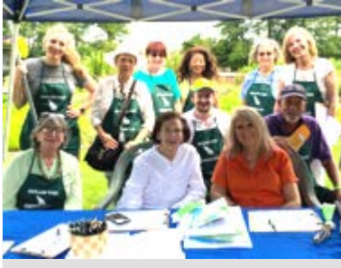
Members working at Highland Park's Secret Garden Tour