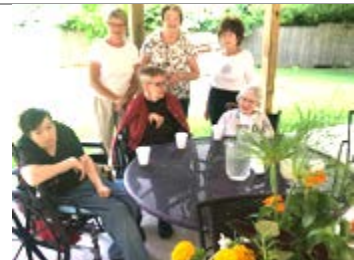
Home Gardeners at The Palms