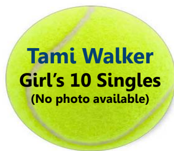
Tami Walker Girl's 10 Singles (No photo available)