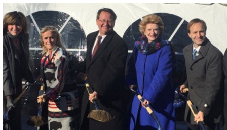
Stabenow, Peters, Dingell Join Michigan Officials to Break Ground on American Center for Mobility at Willow Run

I thought that since some of us went to the Yankee Air Museum at Willow Run last year some of you may want to read about the American Center for Mobility at Willow Run