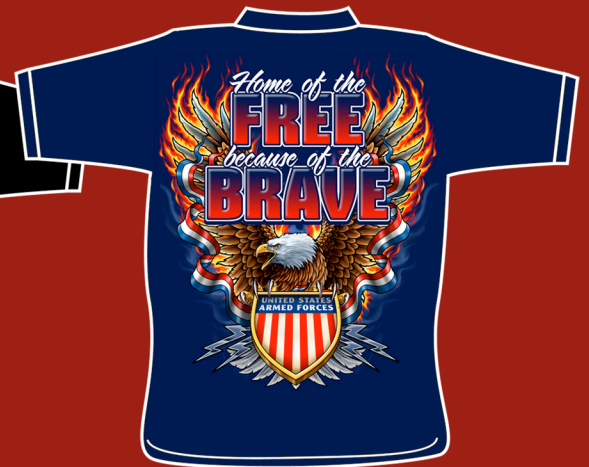
BR1009 HOME OF THE FREE Available on navy blue only.