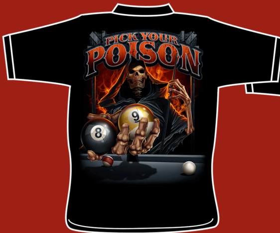
BR1002 PICK YOUR POISON Available on black only.