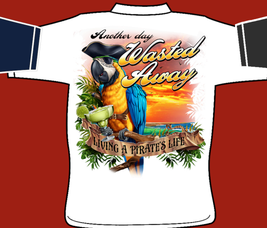
BR1036 WASTED AWAY