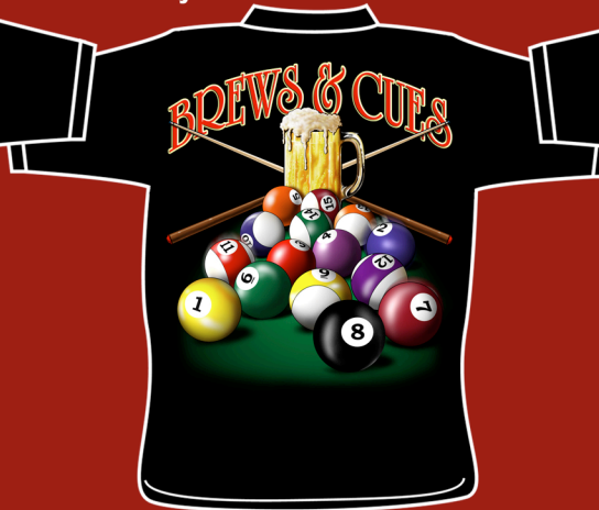
BR1023 BREWS & CUES