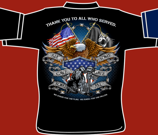
BR1006 SOME GAVE ALL Available on black only.