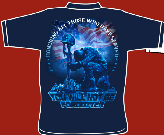
BR1034 HONORING SOLDIER