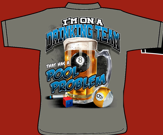
BR1015 POOL PROBLEM Available on charcoal grey only.