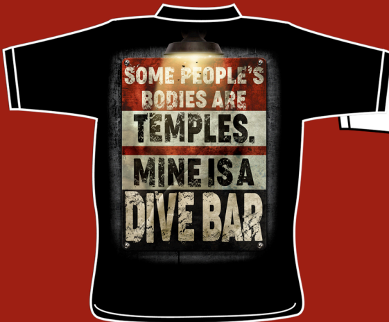
BR1011 DIVE BAR BODY Available on black only.