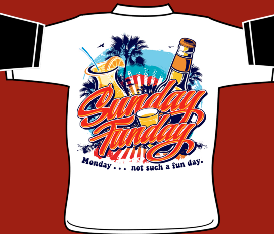
BR1012 SUNDAY FUNDAY Available on white only.