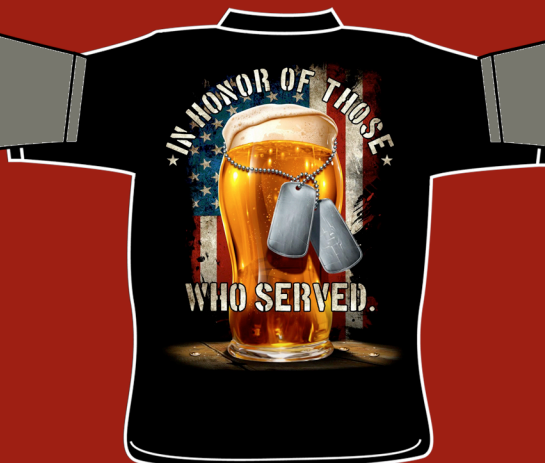
BR1019 DOG TAGS Available on black only.