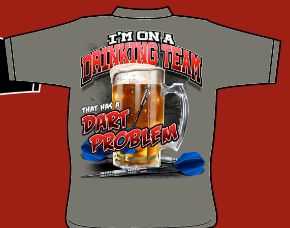
BR1021 DART PROBLEM Available on charcoal grey only.

Designs and styles are subject to change without notice.