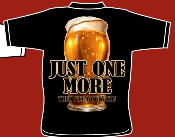
BR1014 JUST ONE MORE Available on black only.