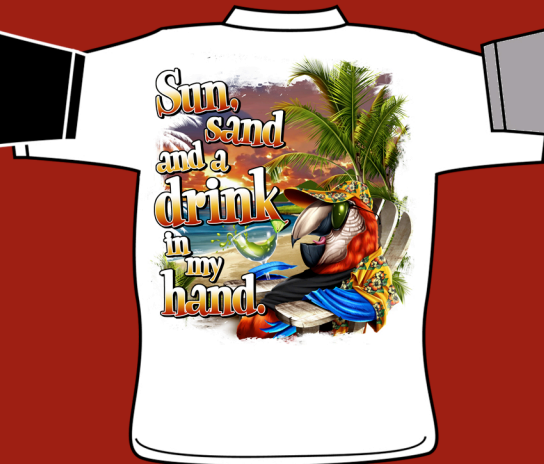
BR1028 DRINK IN MY HAND