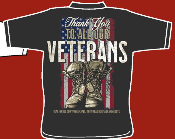
BR1040 THANK YOU VETERANS