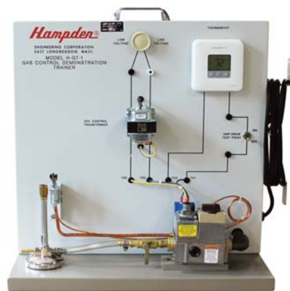
Model H-GT-1 Gas Control Demonstrator Trainer

The Hampden Model H-GT-1 Gas Control Demonstrator Trainer provides students with experience in: