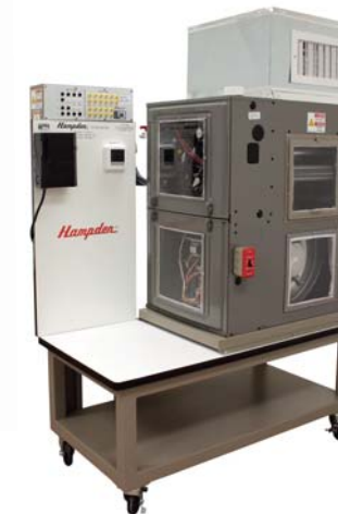
front view ▲