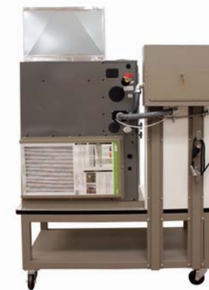
rear view ▲