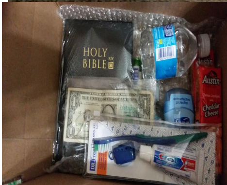
Content of Care Package