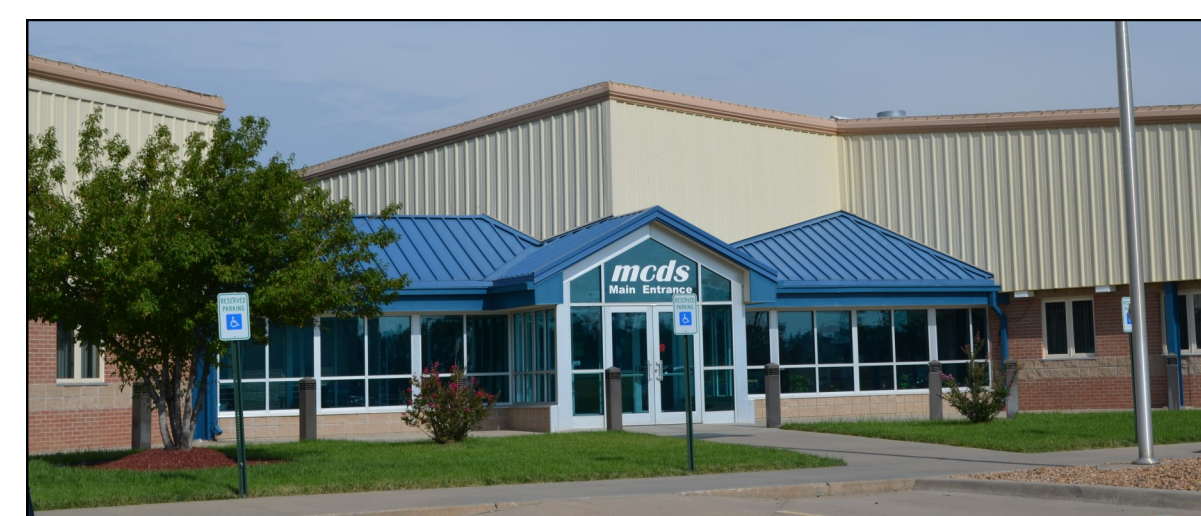
Corporate Offices for MCDS

Work opportunities for persons with disabilities continued to expand into the new century. MCDS contracted with NISH (National Industries for the Severely Handicapped) with McConnell Air Force Base to provide recycling services at the air base in Wichita.