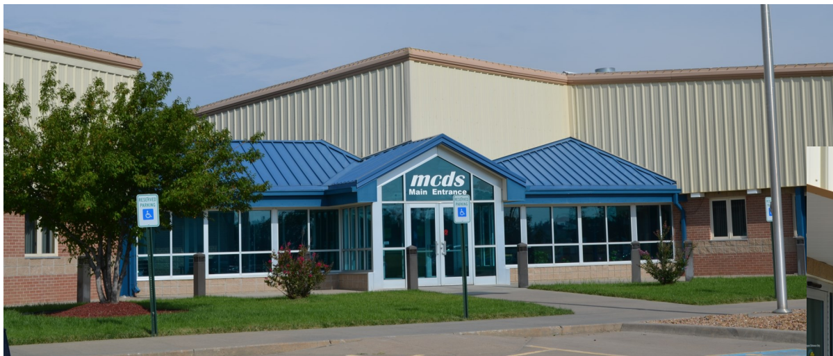
Corporate Offices for MCDS