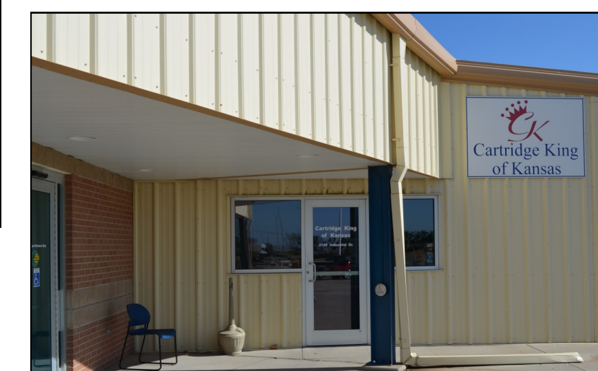
Corporate Offices for Cartridge King

In the spring of 2001, MCDS Board members and executives broke ground for a new facility in the BPU Industrial Park. The new facility included space for administrative offices, case management, day programs, and life enrichment classes as well as a warehouse for MI and Cartridge King.