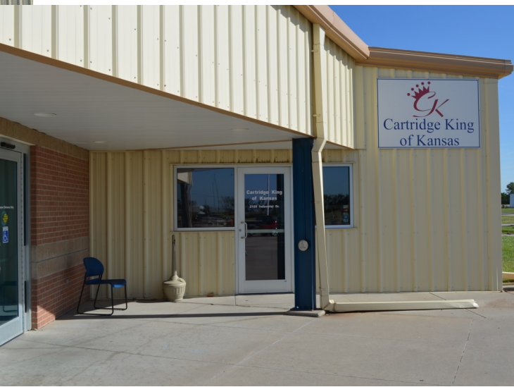
Corporate Offices for Cartridge King