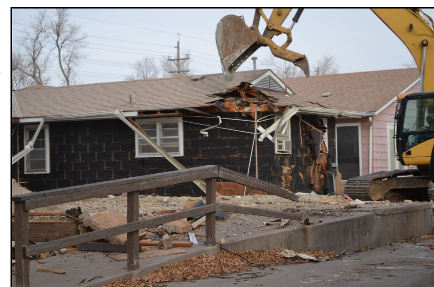
Mac House Demolition

A demolition ceremony was held at Mac House on S. Hickory Street. Mac House was torn down and construction was started on Hickory Heights Apartments. Hickory Heights will be home to 12 clients. Opening is planned for Fall of 2014.