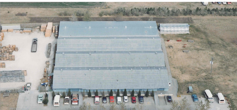
McPherson Industries located on Hwy 81 Bypass in 1990.

With the company's twentieth anniversary and expansion of services to other counties, came a new name change for the corporation. Multi Community Diversified Services, Inc. reflected the organization's commitment to providing a broader range of services beyond the city of McPherson.