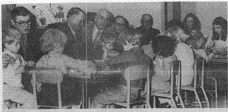
McPherson County Commissioners at Hope Preschool

The preschool program expanded and became Hope Preschool. The following year (1974) the school expanded and changed it's name to Hope Center, Inc. with the intention of expanding services to included adults with disabilities.