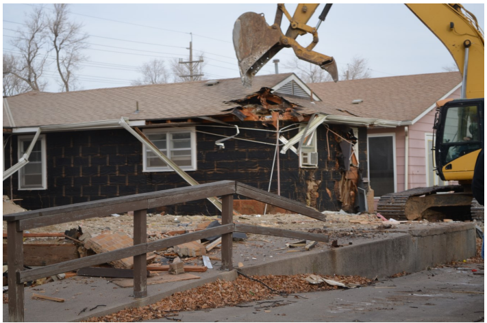
Mac House Demolition

A demolition ceremony was held at Mac House on S. Hickory Street. Mac House was torn down and construction was started on Hickory Heights Apartments. Hickory Heights will be home to 12 clients. Opening is planned for Fall of 2014.