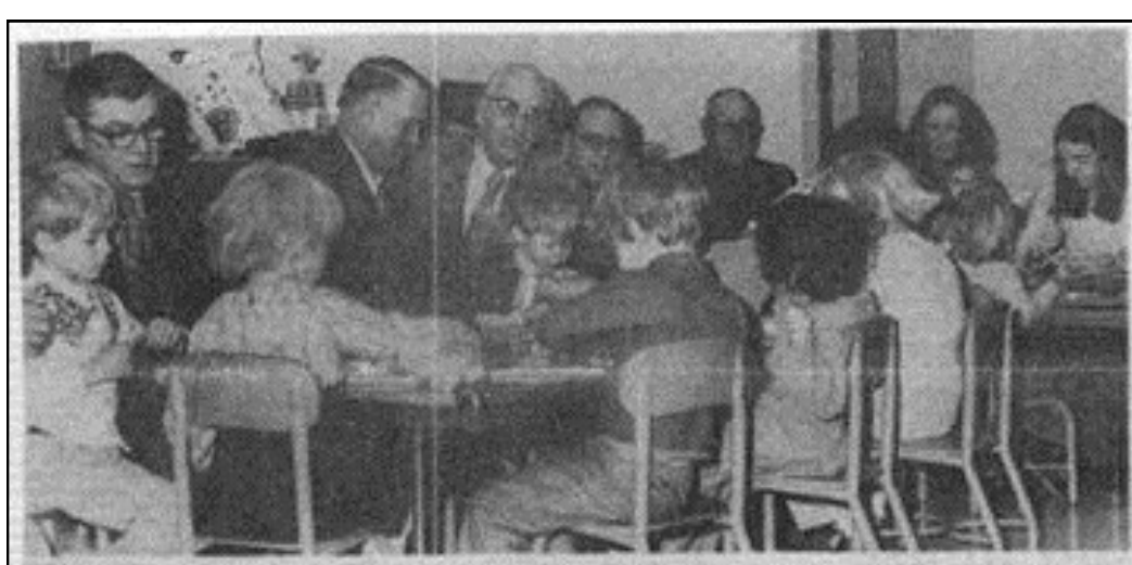
McPherson County Commissioners at Hope Preschool