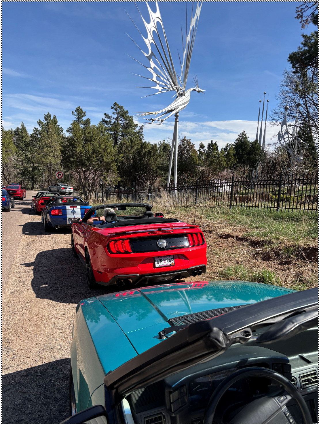
Great silver bird sighted at the Broadmoor/Seven Falls area — draws large crowd of Mustangs