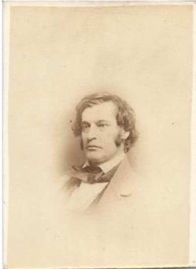
Charles Sumner (1811-1874)

On the Whig side, the nomination on June 7 of another Southern slave-holder, Zachary Taylor, is beyond the pale for many delegates, most notably a contingent from Massachusetts who will go on to play key roles in the emancipation movement.