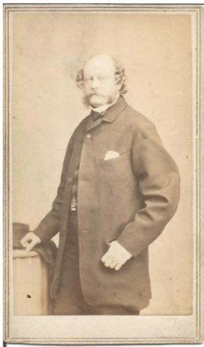
Martin Van Buren (1782-1862)

Other Democrats dissatisfied with the Cass-Butler ticket are the “Barnburners,” ready to bring down the party structure to have their own way.