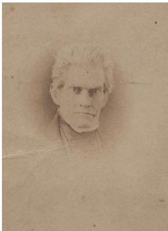
John C. Calhoun (1782-1850)

In response to the devastating threat inherent in the Wilmot Proviso, they are left with a Northerner, Lewis Cass, heading the ticket, and “popular sovereignty” as their best hope for expanding slavery into the west.