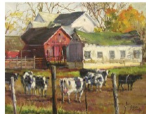
Diebold Farm, oil, 11 x 14"