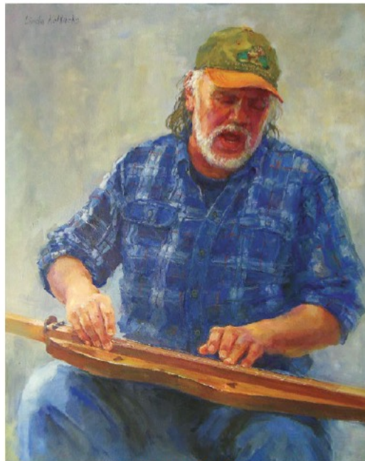
Mountain Melody, oil, 30 x 24"