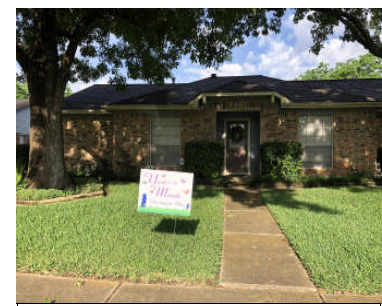
2403 Featherton Ct