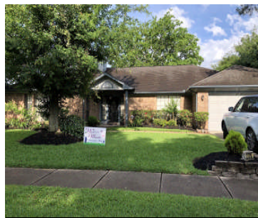
2315 Manorwood Dr