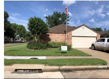
1903 Chattaroy Pl