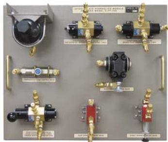
MODEL H-FP/IHS Intermediate Hydraulics