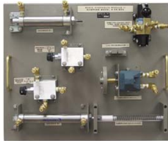
MODEL H-FP/BHS Basic Hydraulics