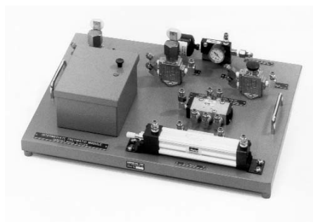
MODEL H-FP/IPS Intermediate Pneumatics