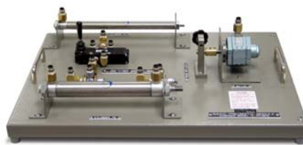
MODEL H-FP/BPS Basic Pneumatics