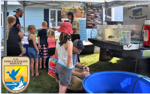
Genoa National Fish Hatchery

Please note that during check-in, you will receive a schedule and map for all exhibits and activities.