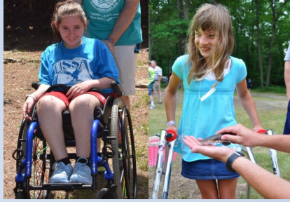
Bass and Crappie fishing from bank or boat

This event is handicap accessible, and there are staff members designated to help assist when needed.