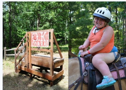
Horseback Riding at the O.K. Coral