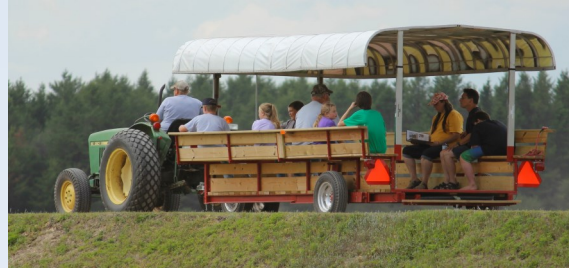
Cranberry Marsh Tour