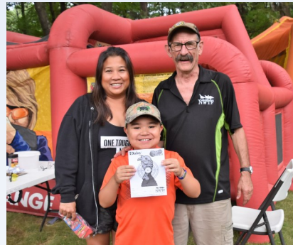
NWTF laser shoot