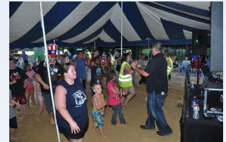
Into the evening, the fun never stops!