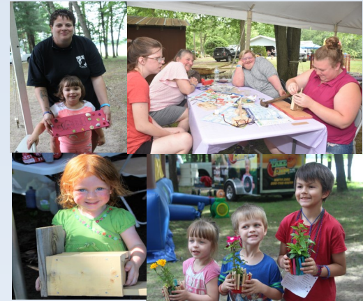
Art & Crafts