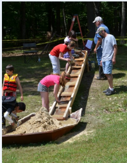
Gold mining and prizes at the Trading Post