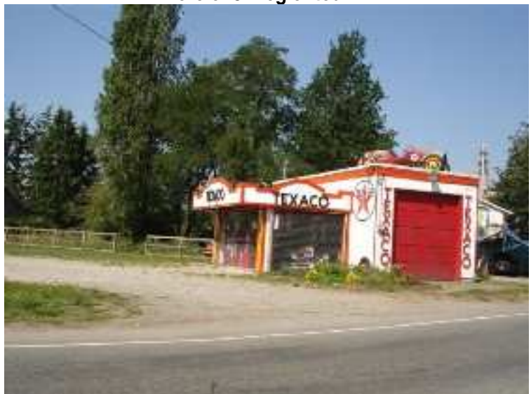
Old gas station on side of road