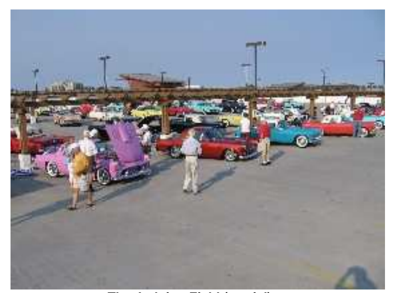
The Judging Field (partial)