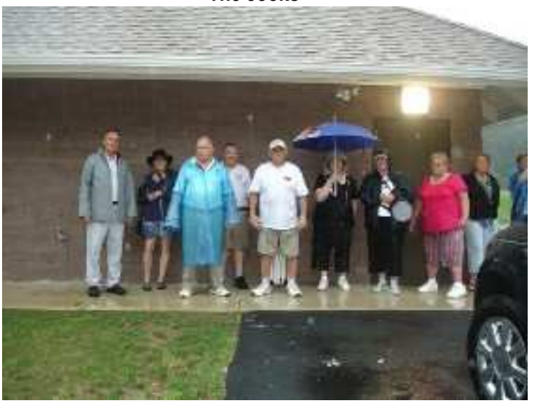
A haven under the eaves