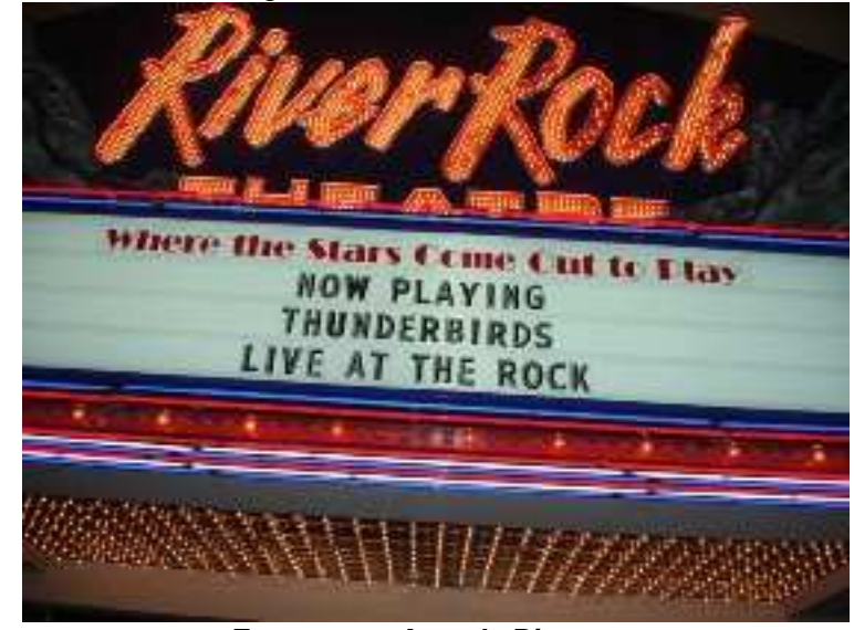
Entrance to Awards Dinner