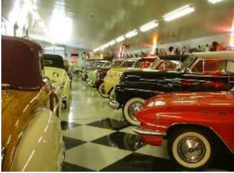
3rd leg- partial collection