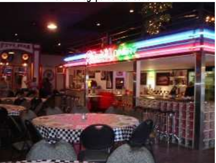
2<sup>nd</sup> leg – Rosies Diner