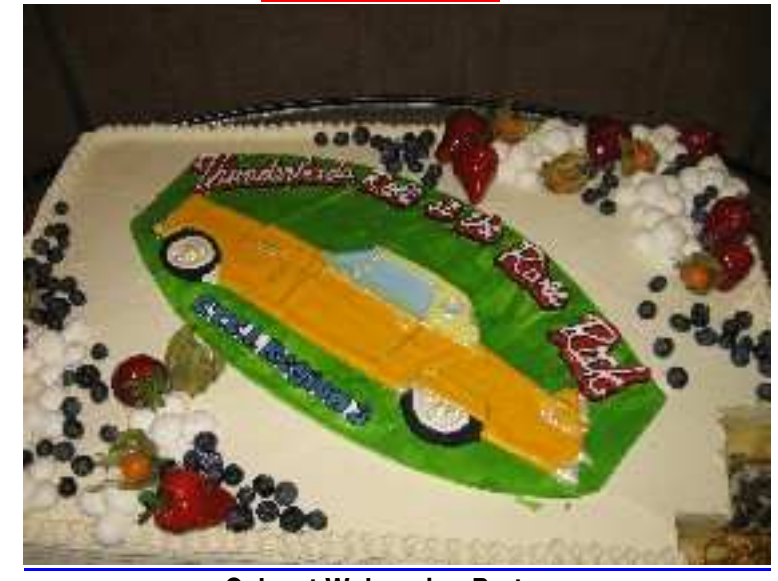
Cake at Welcoming Party