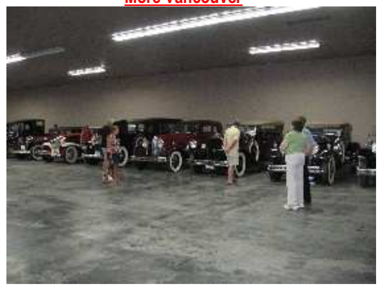
Tour-Ist leg-partial collection