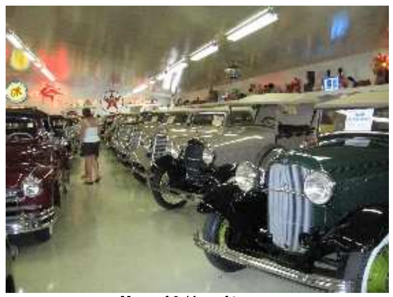
More of 3rd leg of tour