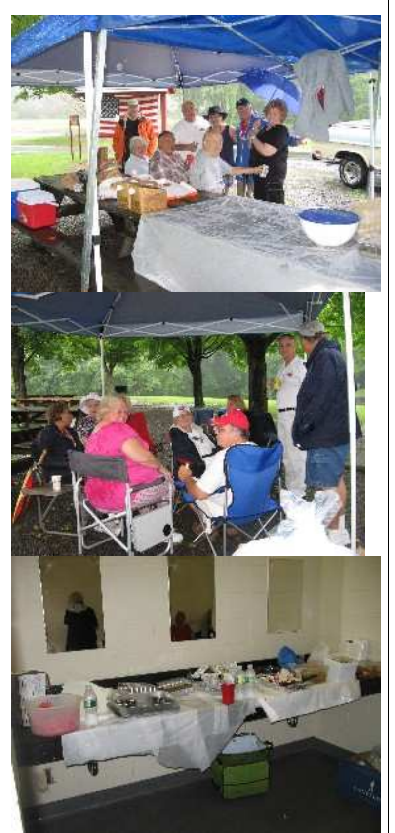
Dessert in the Ladies' room