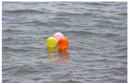
A school of 'Balloonfish'

stomach, ultimately killing them, as the unforgiving bag makes its way through their digestive tract. Seabirds can get entangled in balloon strings, and also ingest plastic particles from balloons and bags, as they float in the ocean looking like the perfect meal.