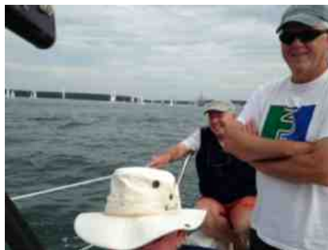
Counterpoint's crew enjoying the Ram Island YC race around Fisher Island