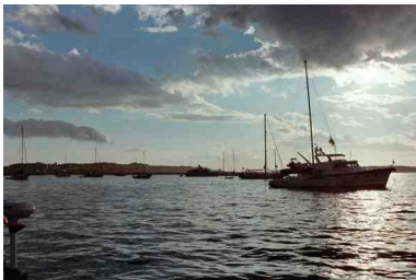
A great summer of 2013 on and near the water!