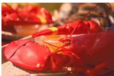
Annual Labor Day Weekend Lobster Bake