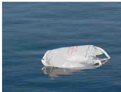
The Dreaded Northeastern 'Bagfish'

There are many things floating in our waterways that can slow our boats down. Be it seaweed, tangles of branches or driftwood, plastic bags, balloons, or other trash. All these items can have a negative impact. Unfortunately, floating plastic debris in particular is becoming a very common sight. More often than not, do we encounter drifting plastic bags or semi-deflated balloons as we sail by. Needless to say, a plastic bag sucked into the water intake of any boat with an engine can become a very costly experience. Unfortunately we had this happen to us the first year we owned our sailboat, and the subsequent fatal overheating of our somewhat ancient (yet until then functioning) engine cost us half a season and a lot of money, of course.