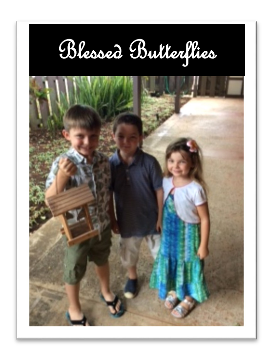
Blessing of the Animals 2015