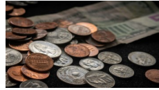
Noisy Offering for TLU Campus Ministry