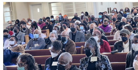
Attendees in the General Session during the Church Finance and Tax Compliance Conference at First Baptist Church Centralia