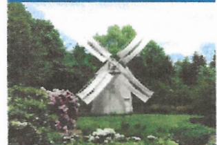
One of Cape Cod's many Windmills

Departure: Jewel Grocery Store Parking Lot, 101 W 87th St, Chicago, IL @ 8 am