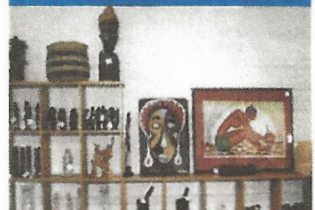
Visit to the Zion Union Heritage Museum