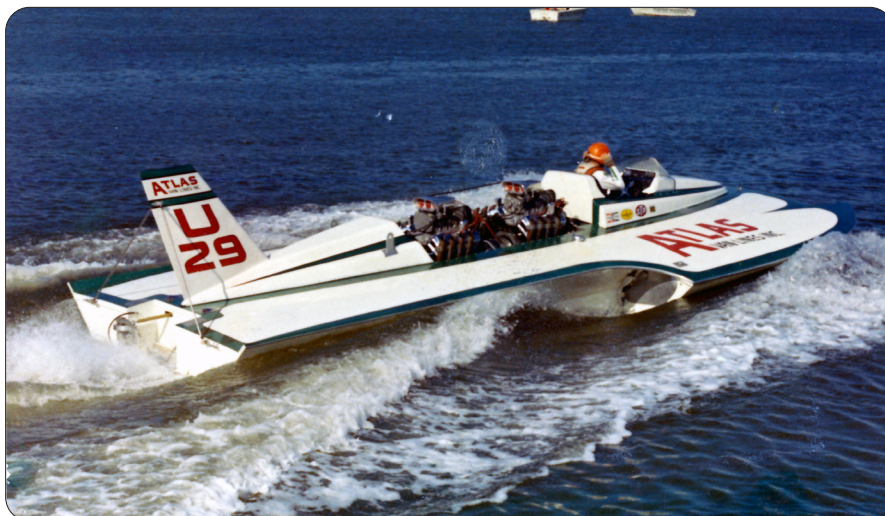
Hydroplane and Raceboat Museum