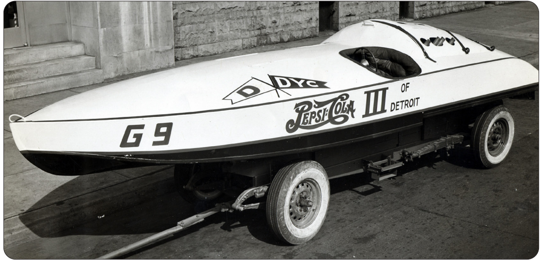
Hydroplane and Raceboat Museum

In their world, such crass commercialism would have been a serious breach of etiquette.