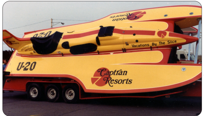
Sandy Ross Collection

Home Security: Miss Island Security Systems, Security Race Products.