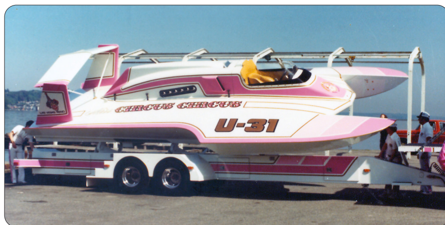
Hydroplane and Raceboat Museum

The Miss Circus Circus at its launching at Seattle in 1979. Circus Circus Hotel & Casino sponsored hydroplanes from 1978 to 1981, again from 1988 to 1990, and then in 1993.