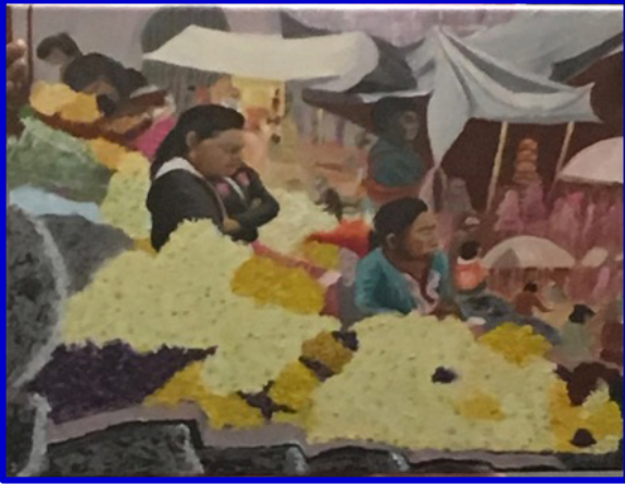
Grumpy Flowers Oil Painting by Oliver Miriam