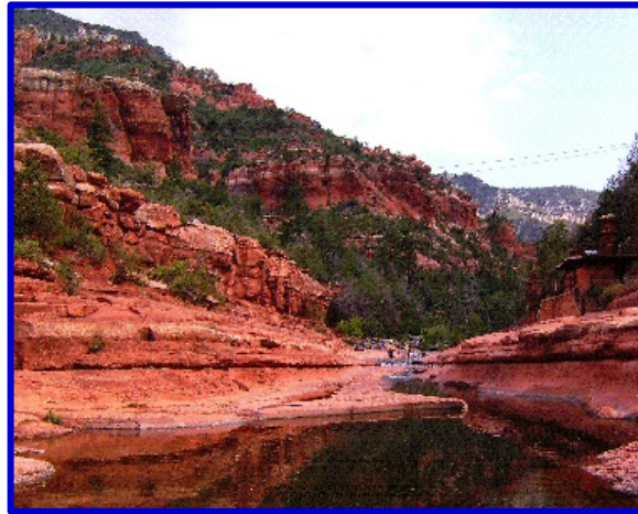
Slide Rock State Park