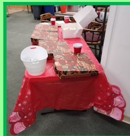
Lining up the pizza, cake, and drinks on the food table.