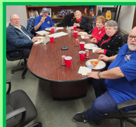
Shipmates and Auxiliary enjoying the pizza!