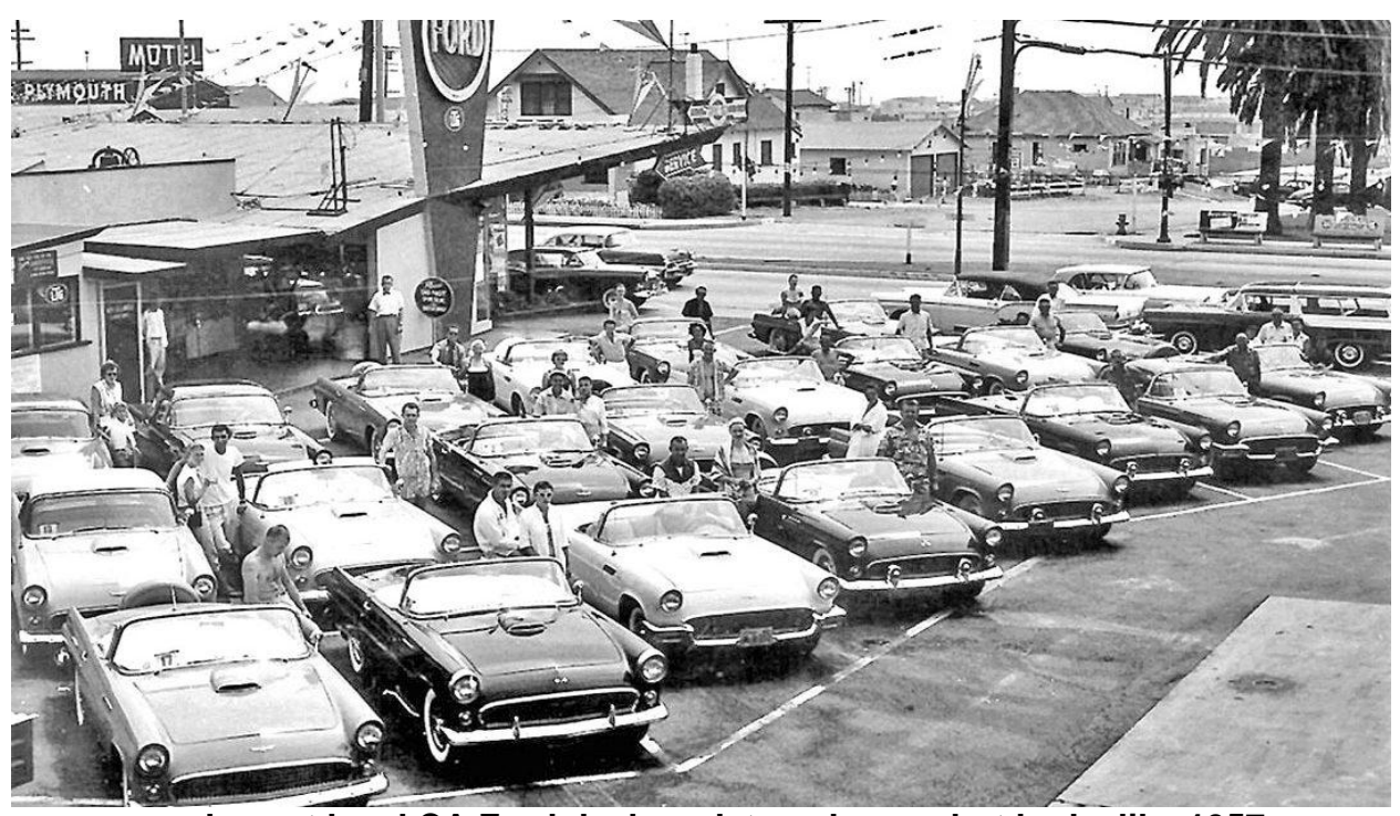
carshow at local CA Ford dealer - date unknown but looks like 1957