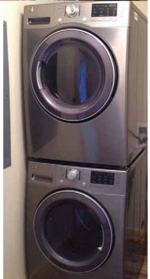
Laundry in mud room/rear entrance.