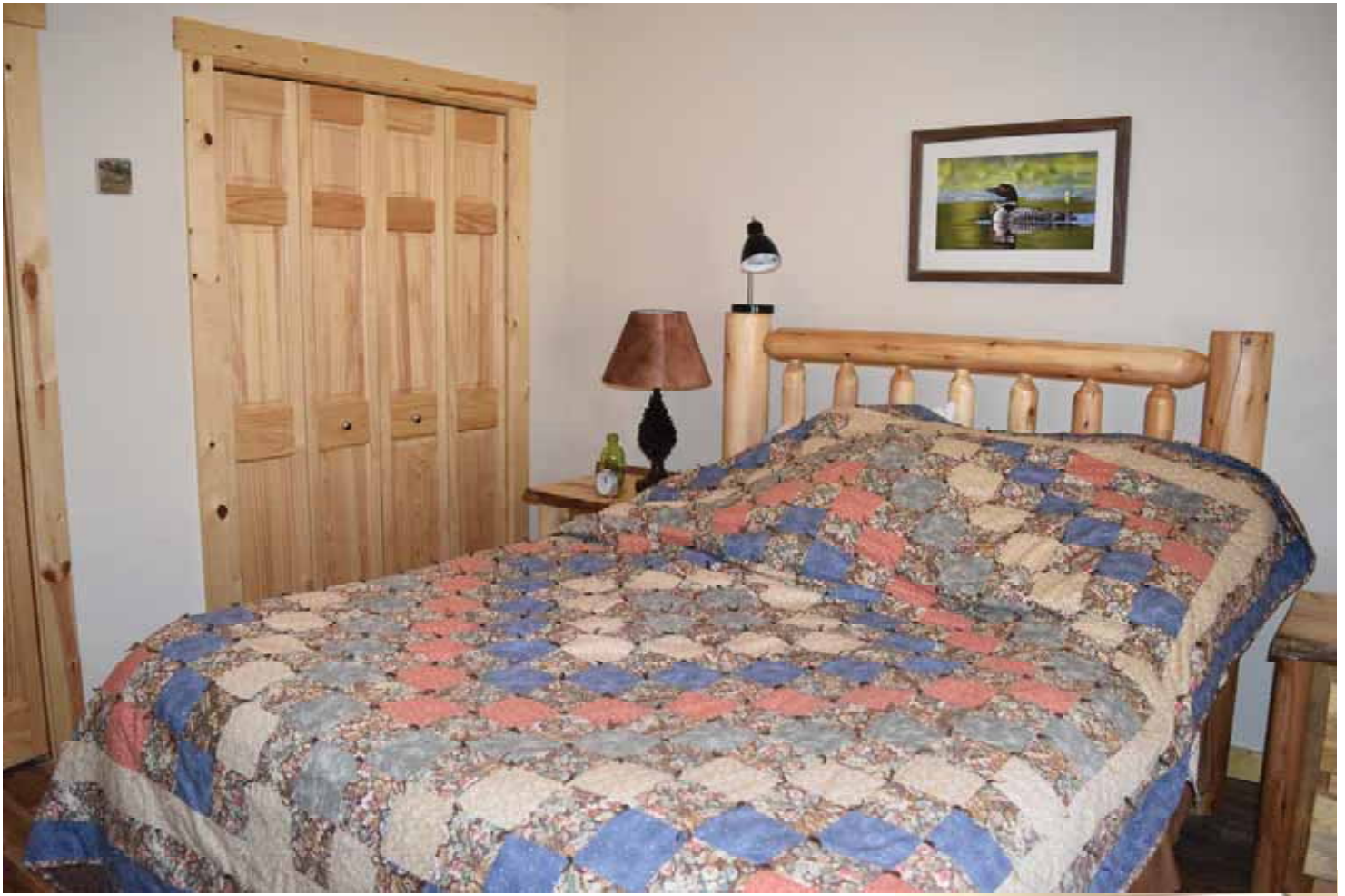
Master Bedroom with 2 large closets.