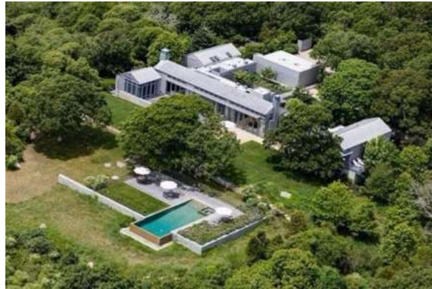
Barack Obama - Chilmark