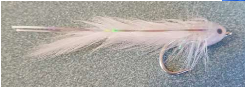
Beautiful (and somewhat pricey) fly from Coop's Bait & Tackle