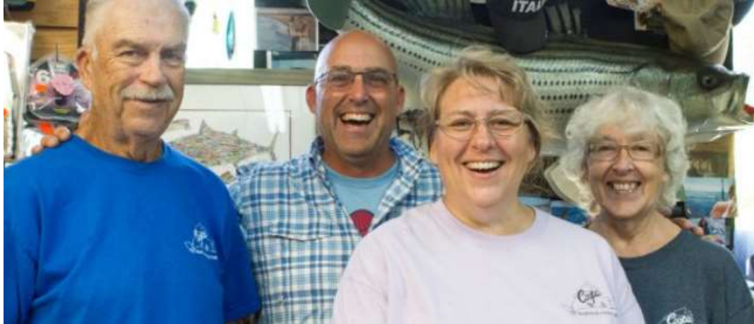
Coop's Bait & Tackle Shop near Edgartown was a popular stop.