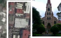
Parque de la Merced