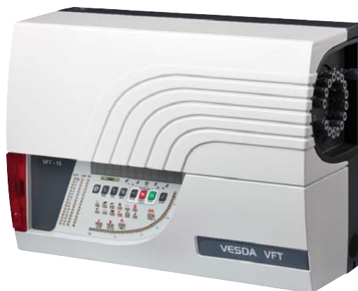
VESDA VFT by Xtralis