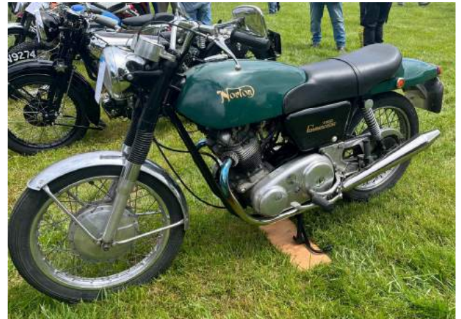
1970 Norton Fastback 750 owned by David Overacker