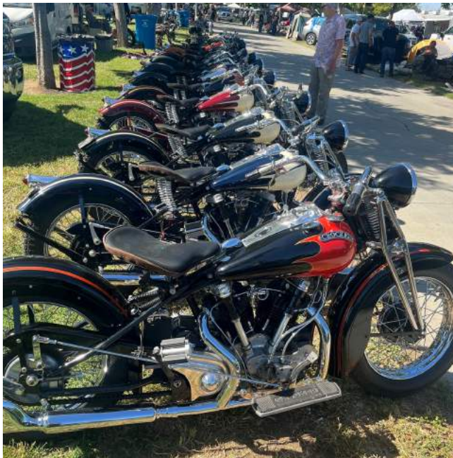
A line of Crockers at Dixon. Cheaper by the dozen?