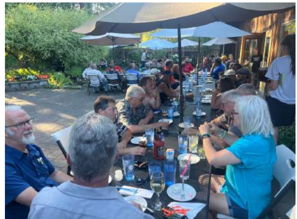
Banquet at Takoda's.