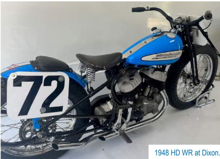
1948 HD WR at Dixon.