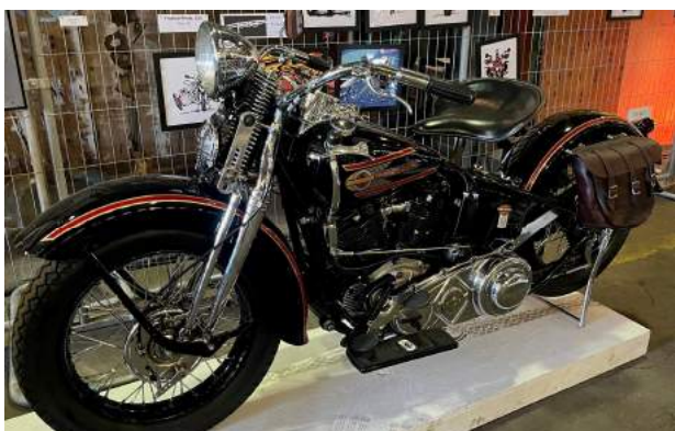
1937 HD EL