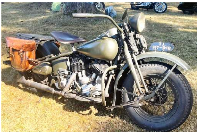
A 1942 South African HD Model U.

Although the photos show primarily Harleys, my primary interest and where I tend to take pictures, there was a large selection present representing other brands as well as motorcycle clothing, nick-nacks, and paraphernalia.