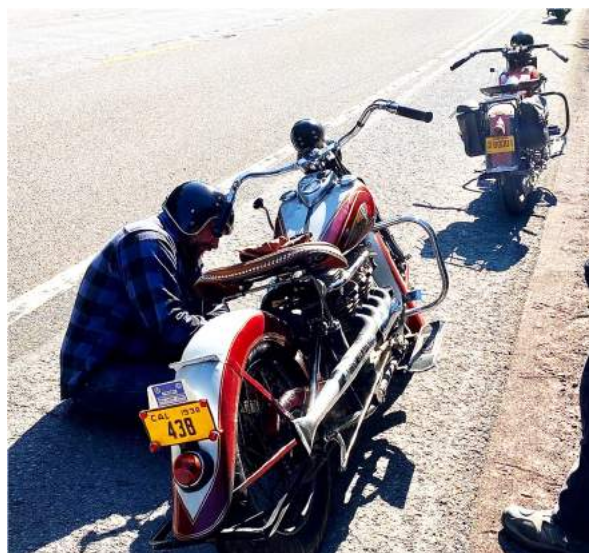
We've all been here before.