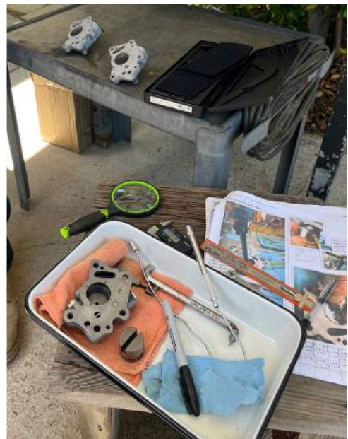
Side-valve oil pump evaluation.