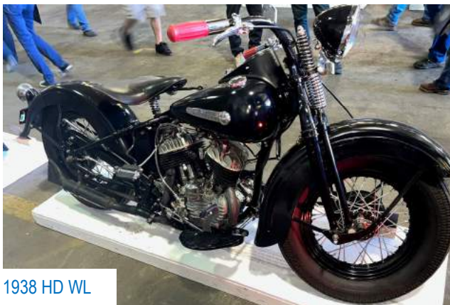
1938 HD WL