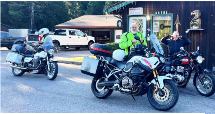
The Nevada contingent arrive at Harbick's Country Inn.