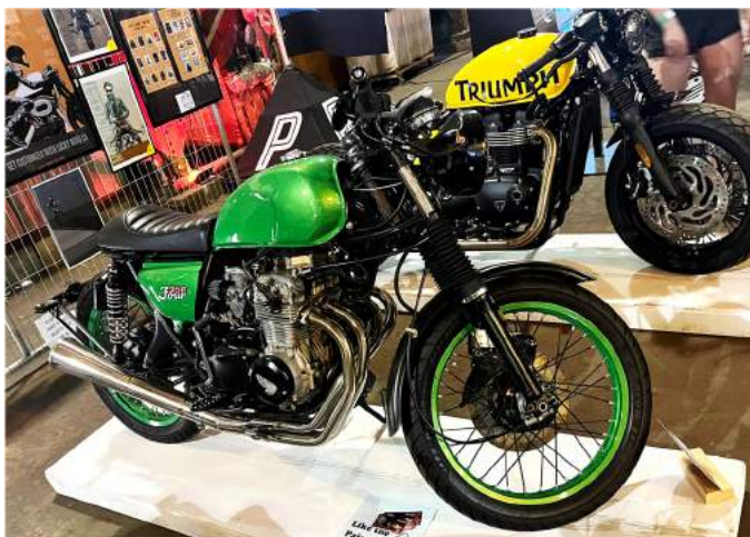
1973 Honda CB350F