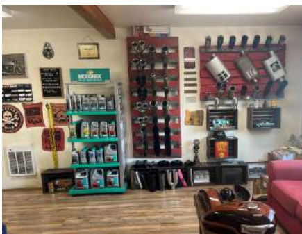
6-Volt Cycle in Bend