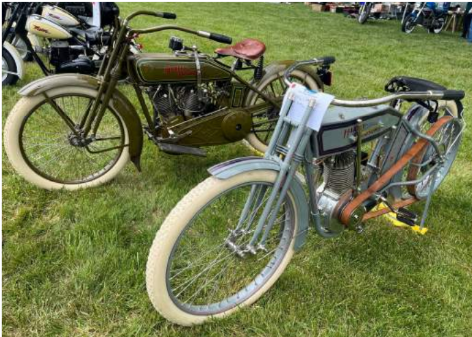
1920 HD Model J and 1912 HD Model X8A, owned by Tim Burns