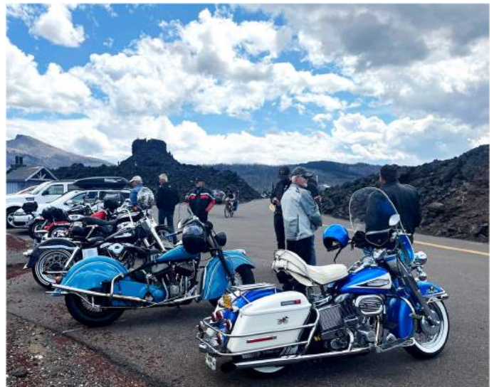
At the summit of McKenzie Pass. Dee Wright Observatory in background.