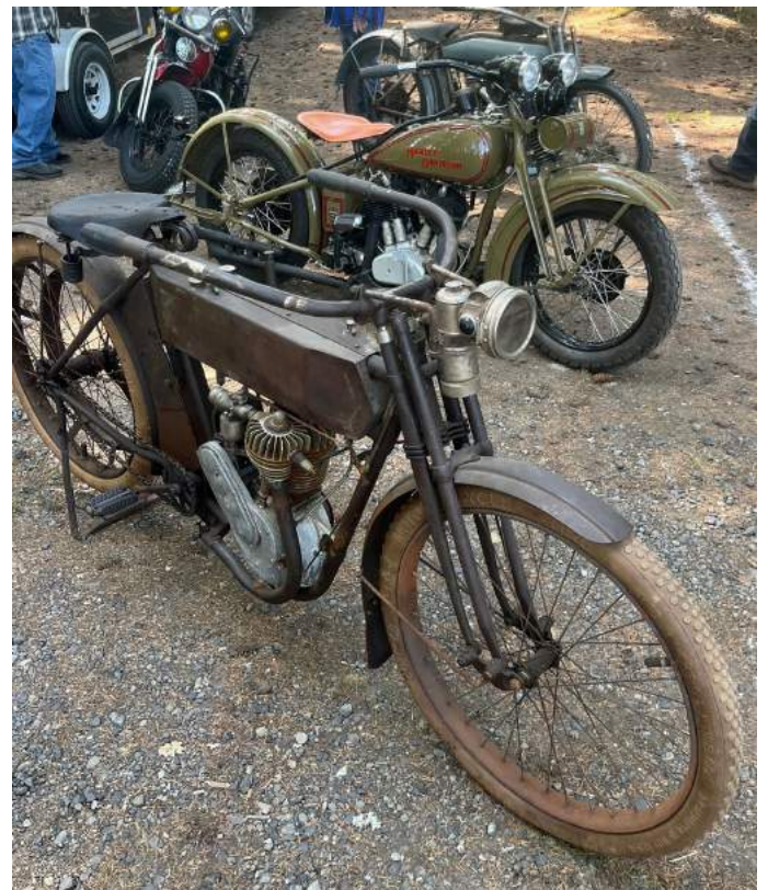
One of many impressive line ups at Tenino.

Although the photos show primarily Harleys, my primary interest and where I tend to take pictures, there was a large selection present representing other brands as well as motorcycle clothing, nick-nacks, and paraphernalia.