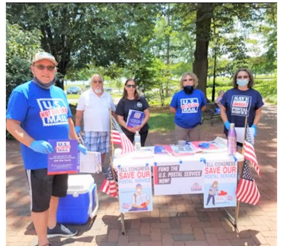
Saint Charles Missouri