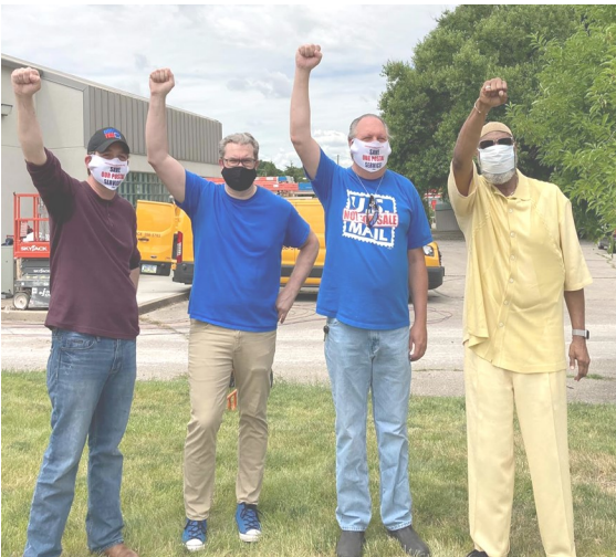
Des Moines Iowa