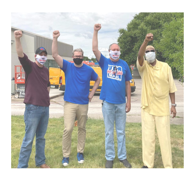
Des Moines Iowa

Why caravans? The postal service needs to be a part of the Heroes Act, but not at the expense of anyone's health. The Covid-19 threat has not gone away, nor will it anytime soon. Wearing masks, social distancing, and staying in our cars was a good way to keep people safe while eliciting support.