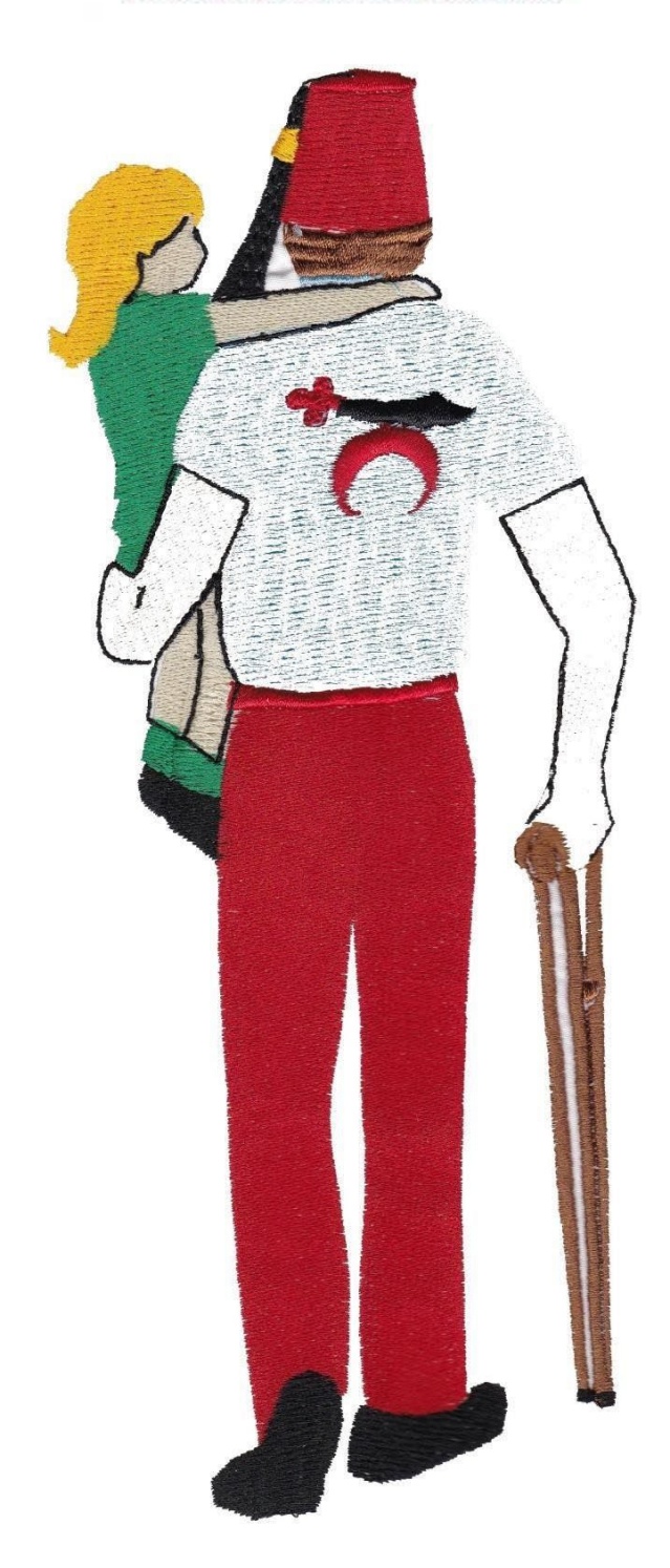
Who are the Shriners

Dedicated To Helping Children With Orthopedic, Burn, And Spinal Cord Injury Conditions Through Our Shriners Hospitals