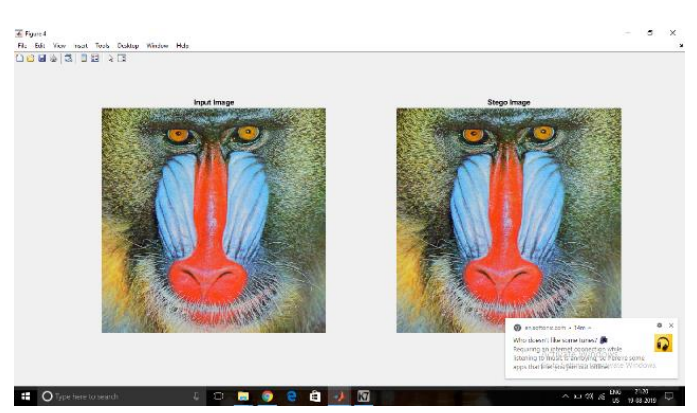
Fig1: Tested image baboon