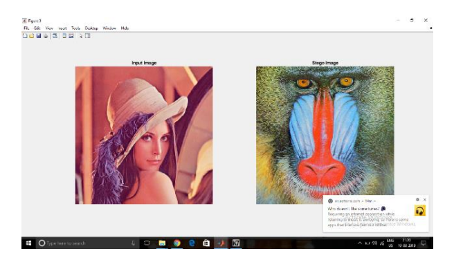
Fig2: Tested image for lena and baboon image

ISSN: 2393-9028 (PRINT) | ISSN: 2348-2281 (ONLINE)