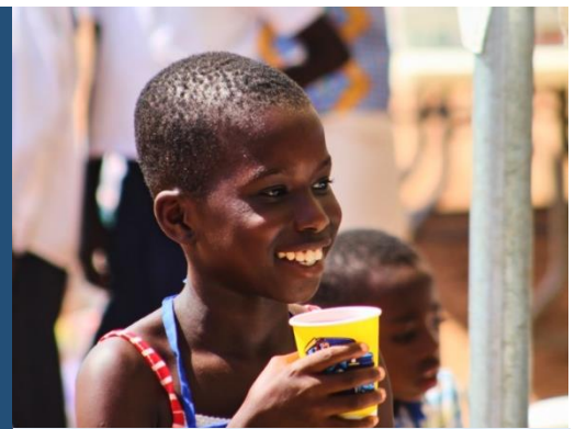
A child in Ghana enjoys the celebration of distributed goods.

The financial wing of the Salvatorians, the “Salvatorian Center,” with which we share the building, will soon move to a new location. Mail with their 53062 zipcode will be forwarded to them, so please be sure to use our regular 53061 zipcode for timely communications.