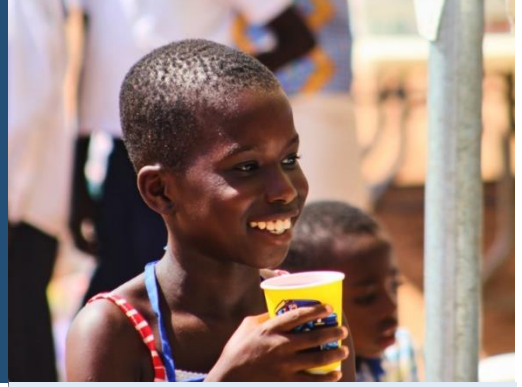
A child in Ghana enjoys the celebration of distributed goods.

The financial wing of the Salvatorians, the "Salvatorian Center," with which we share the building, will soon move to a new location. Mail with their 53062 zipcode will be forwarded to them, so please be sure to use our regular 53061 zipcode for timely communications.