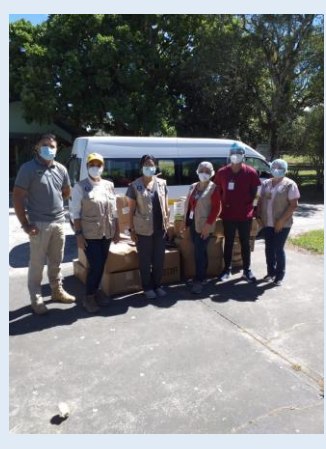
This is the Covid Biosecurity Task Force. They took scrubs, patient gowns, and other items.