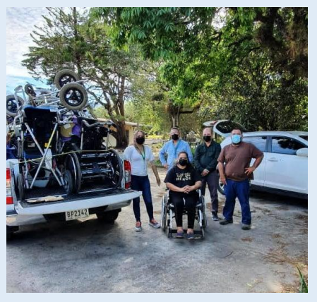
Good wishes for you guys. Yesterday we gave seven wheelchairs for young adults with special needs. There is an association in our province and they really needed them. They also took three exercise mats and disposable diapers.