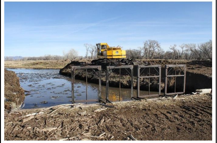
Headgate and feeder ditch