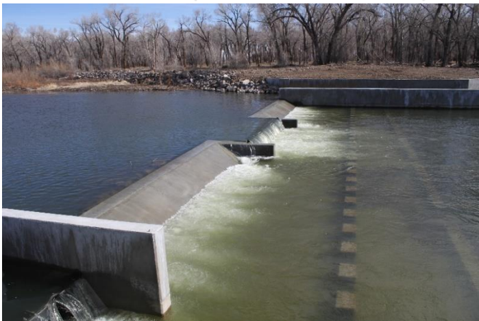
Diversion dam (Consolidated D diversion)