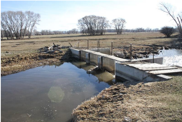
Consolidated Slough Weir