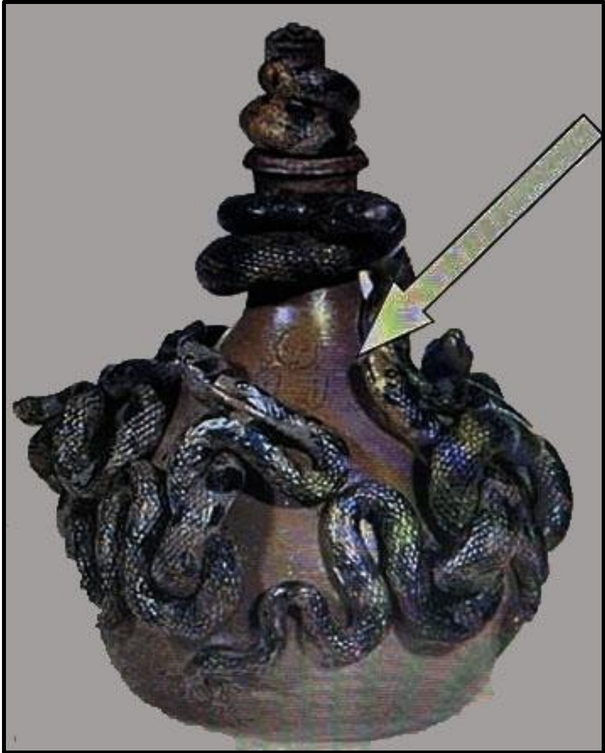
Kirkpatrick hand etching of the “Chester Idol” applied to an exquisite snake jug