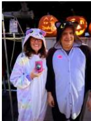
Best Pumpkin Carving