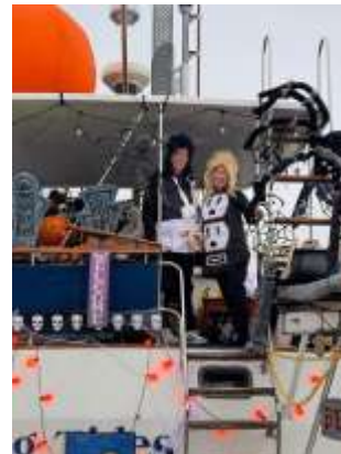
Best Decorated Boat