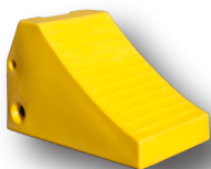
Part # WC-UY910**