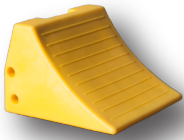
Part # WC-UY710*