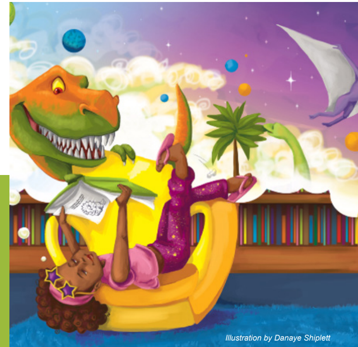
Illustration by Danaye Shiplett