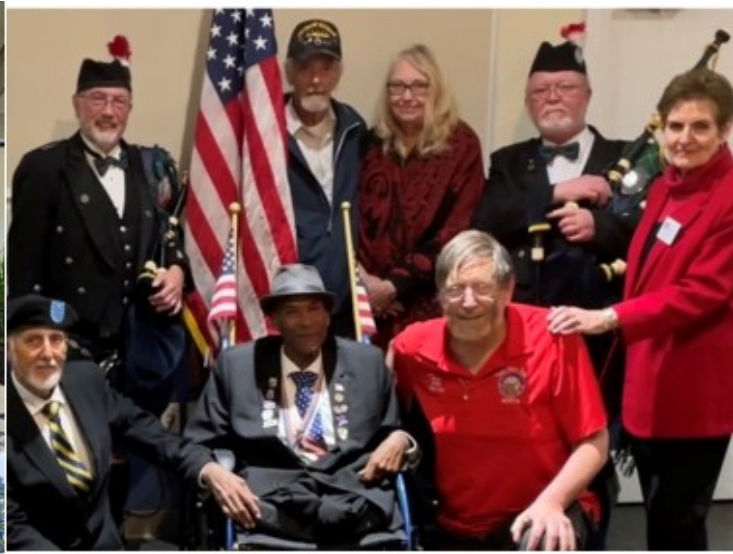
Toms River Elk's presentation Veterans Day

Rebecca's Reel Quilters Stitching the hearts of our veterans View Quilts of Valor photos here>>