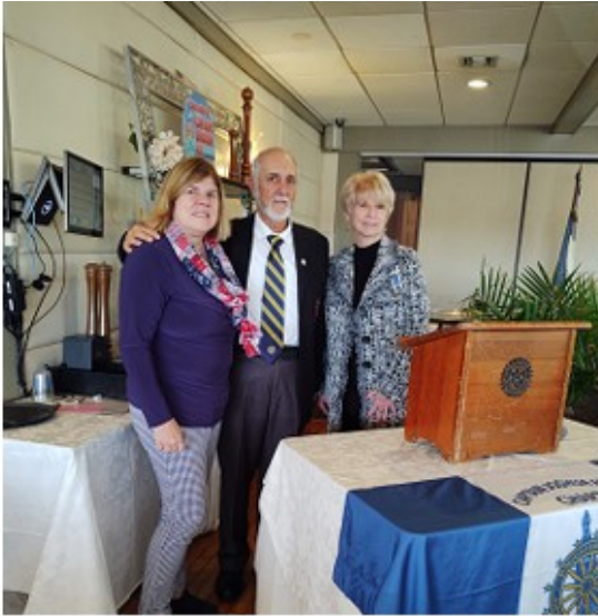
DAR presentation 11/12/22