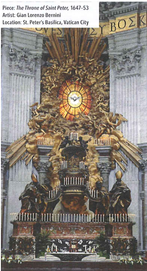
Piece: The Throne of Saint Peter , 1647-53 Artist: Gian Lorenzo Bernini Location: St. Peter's Basilica, Vatican City