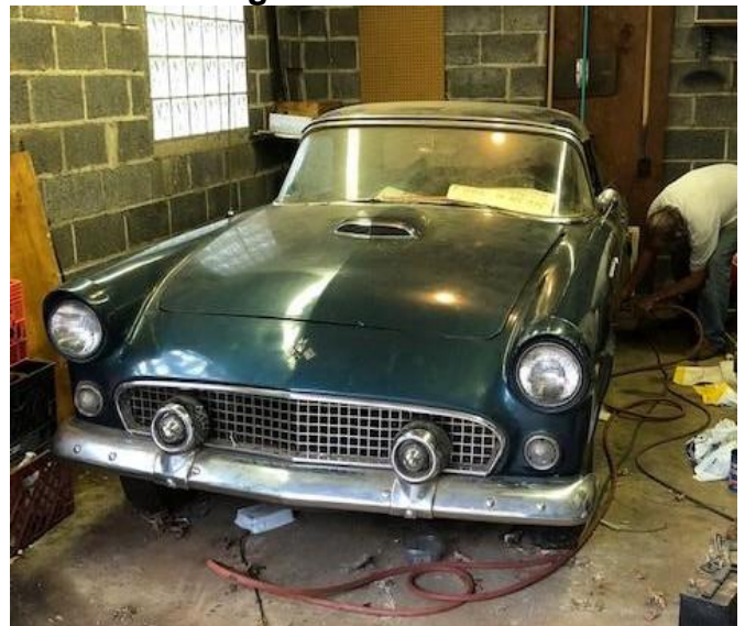
Garage Find - 35 Years later

The only thing nice about being imperfect is the joy it brings to others