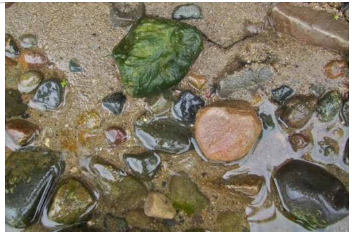
Cladophora algae attached to rocks along the lakeshore. This indicates a high nutrient load in the water.