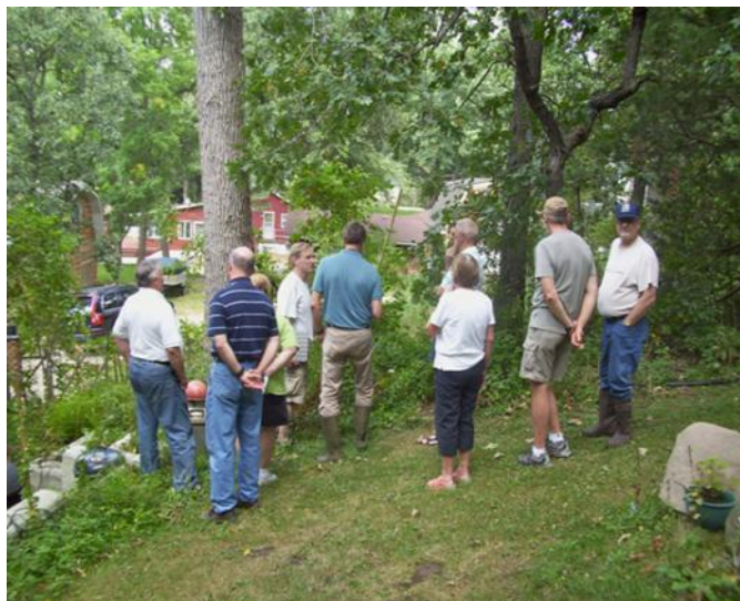
Groundtruth Class verifying a Lake Julia property