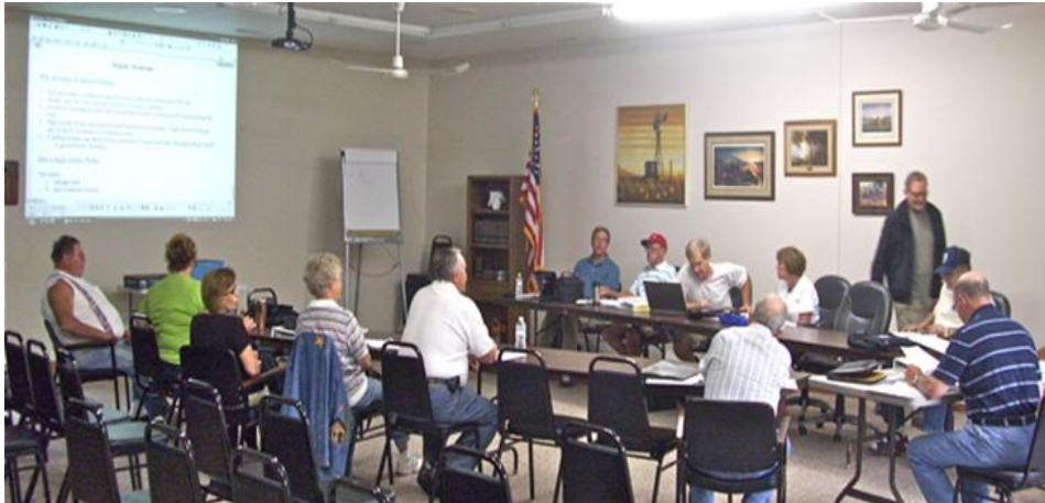
Groundtruth Class at Palmer Township